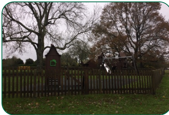
Lady Hope Play Area - RH14 0PX